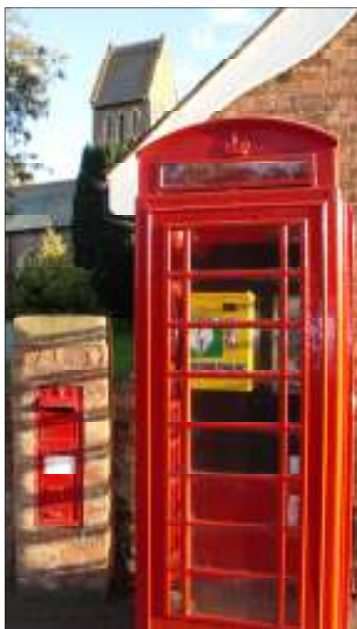
A village defibrillator in the Leicestershire village of Carlton, placed in the decommissioned telephone box in the centre of the village.

The current Vale defibrillator project allows for a village group to apply for match funding for a community defibrillator, if the community wishes to have one available. Information on this has been sent to the respective Parish Councils in the Vale area. This is a time limited offer and the funds are distributed on a first come first served basis. If anyone would like to know more on Community Access Defibrillation schemes, and how they support CFR schemes in a village, or would like to take the lead in the placement of one in your village, then please feel free to contact the Community Heartbeat Trust via the website on www.communityheartbeat.org.uk